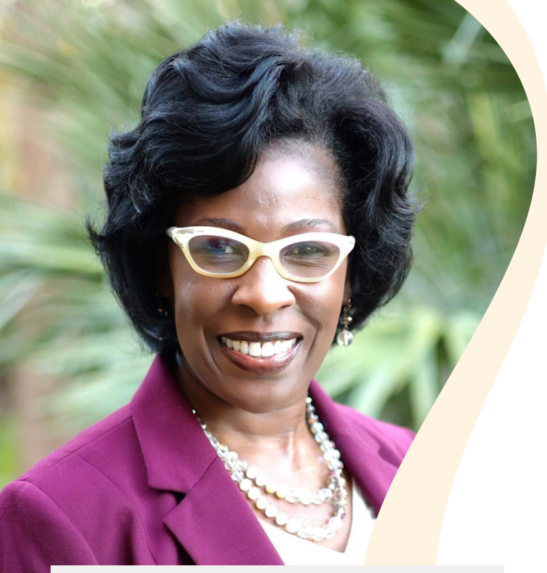
Vice President for Student Affairs