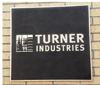
Turner Industries, sponsor, new outside seating area