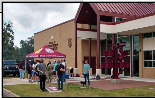
Spring SoCM Student Cookout