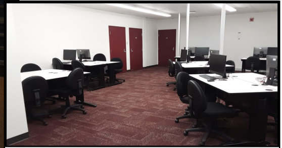
Open Computer Lab: $75,000, funded by CETF